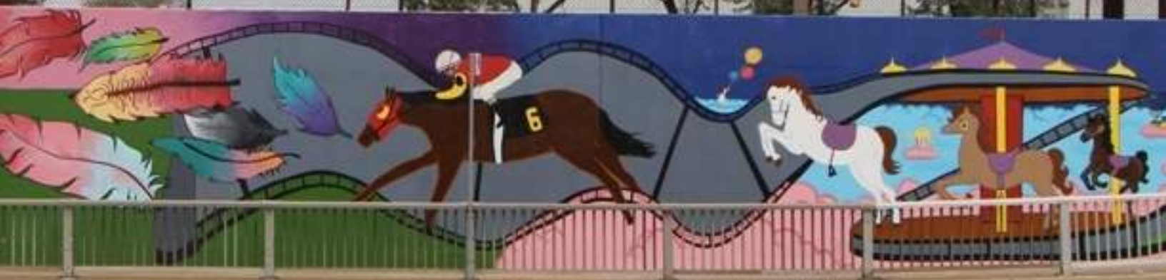
Rexdale Community Gateway Mural