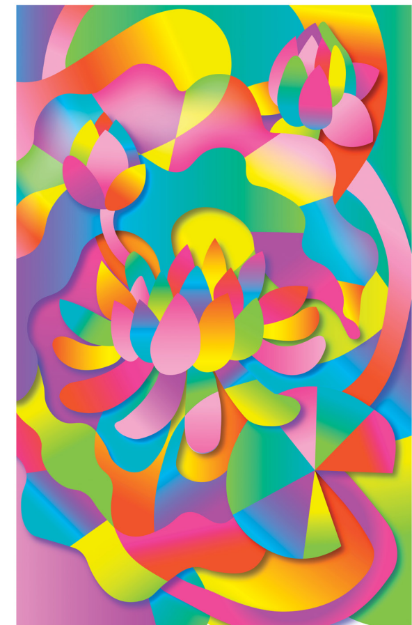
Persephone's Panganat: Pause & Reflect: A Self-Care Invitation, 2022

But also the fact that there's placed importance courageous conversations, anti-oppression and also just social justice in general makes VIBE unique because with all of those different aspects it creates an ecosystem where there's transformational change that can happen just from participating in arts engagement.