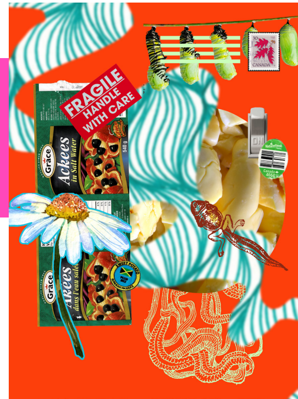
Persephone's Panganat: Coolie, 2022

JV: My biggest takeaway would be the power of mentorship because it invests energy and the mentors get into that relationship because they have witnessed or experienced themselves needing that additional push. I was super grateful that I was able to get