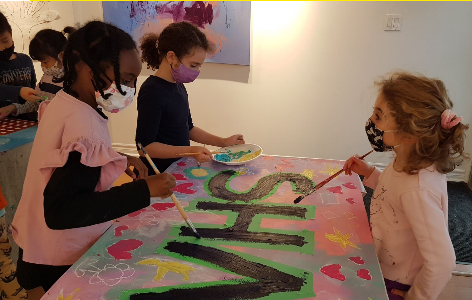
Participants in a Mural Making Workshop at Arts Etobicoke, November 2021