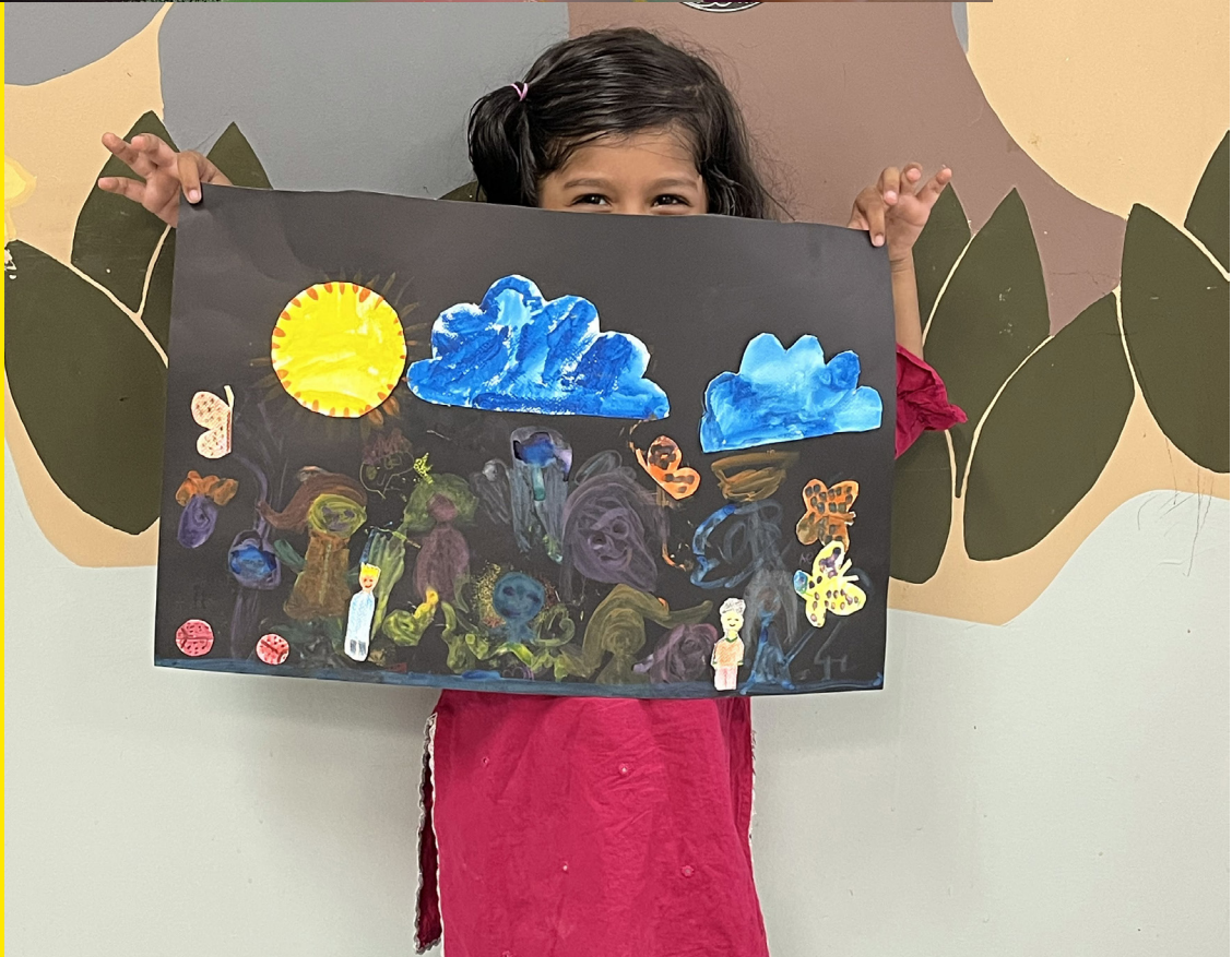
Participant showing off a piece created in a painting workshop for children and their parents at TNO Kids, August 2022